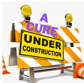
Let's rebuild Relay in Macon County!

Mark your calendars for Relay for Life 2022— “A Cure Under Construction”. July 15th, 2022. The Survivor Lap starts at 6:00 PM, followed by an ice cream social.